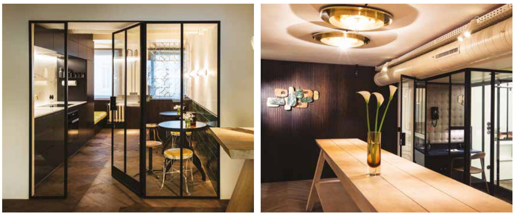
The lighting elements were designed and produced specifically for this project; developed in collaboration with the company PS-Lab.